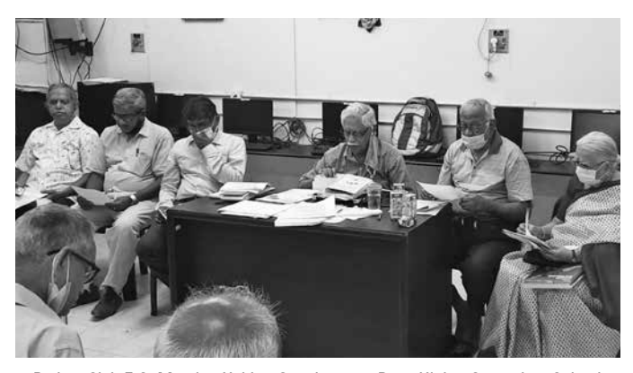
Probus Club E.C. Meeting Held at Gopalapuram Boys Higher Secondary School