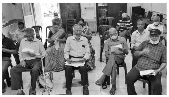
Probus Club E.C. Meeting Held at Gopalapuram Boys Higher Secondary School